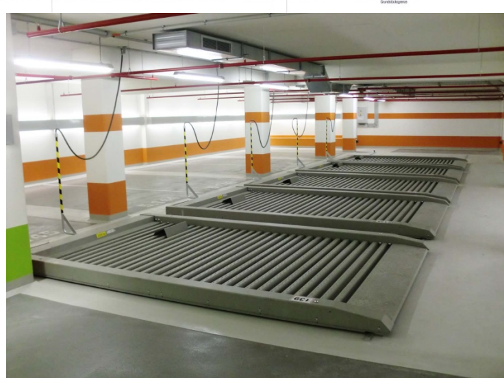
Final design of parking garage (top)@ProConcept, vehicle management system (below)@nussbaum